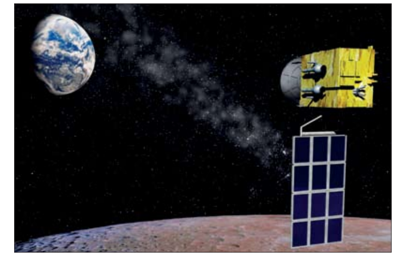
2: MoonLITE is a UK concept for a science-driven lunar mission that would exploit UK expertise in small satellites. (Artist's impression, UCL)